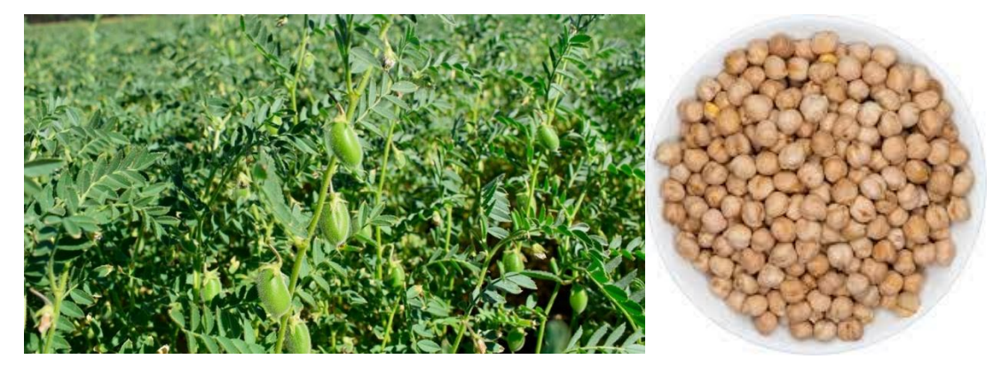
Figure 1. Chickpea crop condition during growth and harvesting.

In the pod formation stage, chickpea pods start to form after flowering. At this stage, the plant requires more water and nutrients. The pods gradually increase in size, and the seeds inside begin to develop. The next stage is the ripening of chickpea pods, where they turn yellow or brown, and the seeds inside harden. During this phase, the plant's water demand decreases. Once the pods are fully ripe, the crop is harvested.